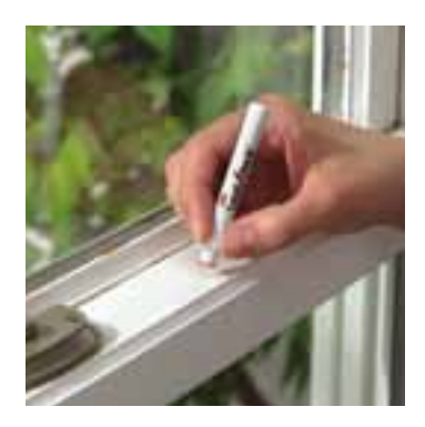
3M<sup>™</sup> LeadCheck<sup>™</sup> Swabs help certified renovators meet the requirements of the RRP Rule by making lead testing simple.