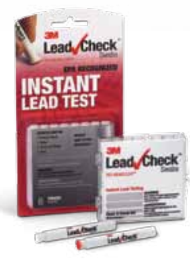
3M<sup>™</sup> LeadCheck<sup>™</sup> Swabs are available in retailer and contractor packs. See last page for ordering info.